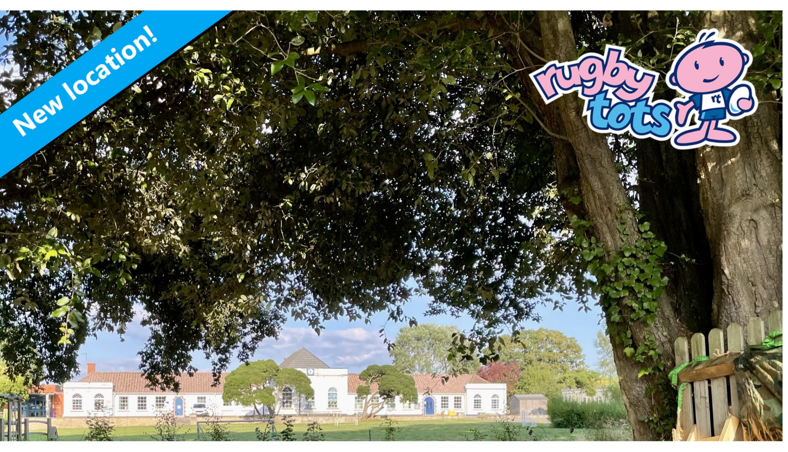
Hindhayes School, Street on Saturday mornings